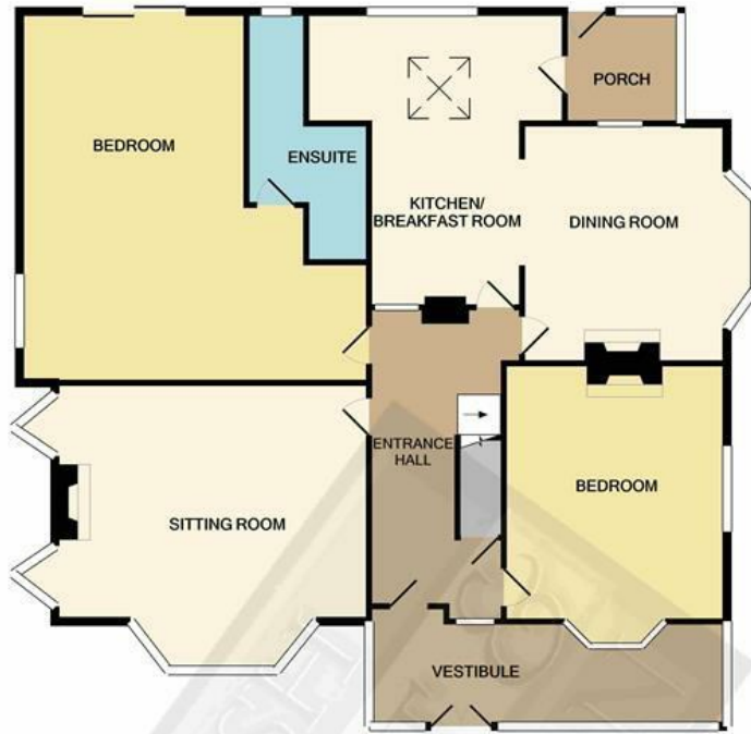
GROUND FLOOR APPROX. FLOOR AREA 1355 SQ.FT. (125.9 SQ.M.)