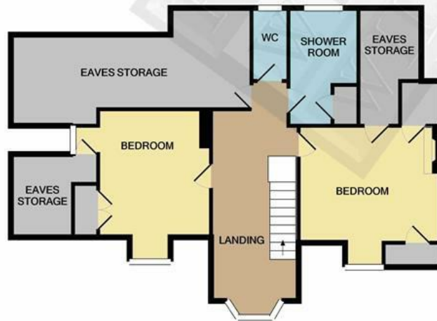
1ST FLOOR APPROX. FLOOR AREA 706 SQ.FT. (65.6 SQ.M.)